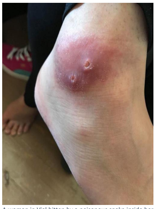
A woman in Vial bitten by a poisonous snake inside her tent (28 July). Immediate medical treatment was required.

Accommodation conditions present health and safety risks: severe overcrowding in the camp, compounded by the poor condition of hygiene and sanitation facilities, leads to serious health risks and facilitates the spread of infectious conditions and diseases, notably lice infestations and skin conditions such as scabies. People in the camp are also frequently exposed to rodents and insects snakes, rats, scorpions, spiders - due to poorly maintained accommodation and no provision for regular pest control. Moreover, a large amount of rubbish is being stored inside the Vial compound. Furthermore, a focus group conducted in late July indicates that women do not feel safe as many container doors cannot be locked, windows are frequently broken, there is little to no privacy, and there are instances of women having to share accommodation with unknown men.