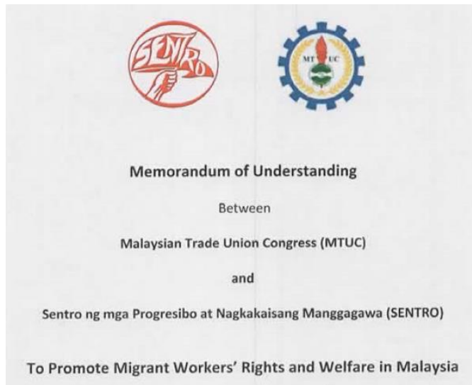
Figure 2: Detail from Memorandum