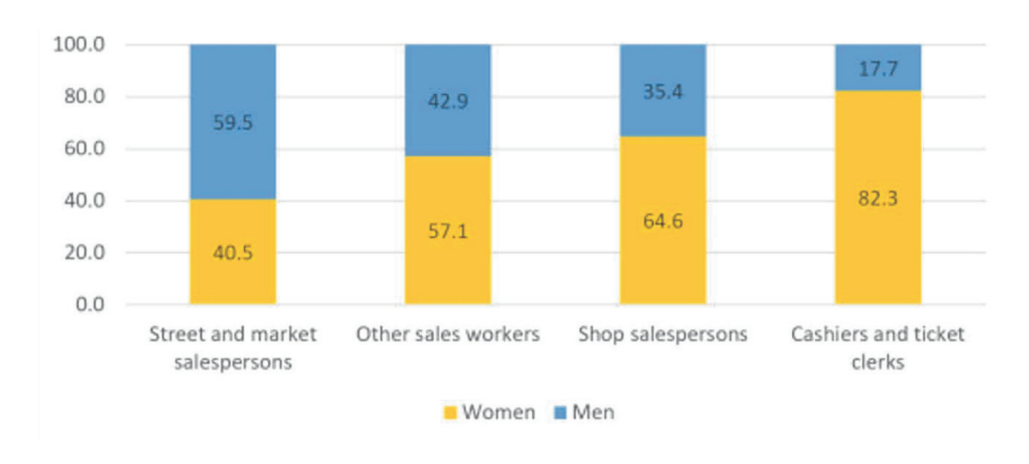
Sales roles by gender (%) (Eurostat, Labour Force Survey)

The pandemic has affected women not just as carers but across a wide range of sectors. Altogether, about 84 per cent of working women aged 15-64 are employed in services, including retail, hospitality and tourism, which have been hardest hit by lockdown and face serious job losses. The pandemic has particularly affected sectors where, as a result of gender segregation, more women are employed. For example, women make up 82 per cent of all supermarket cashiers (see bar chart), who suffer high exposure to contact with the virus.