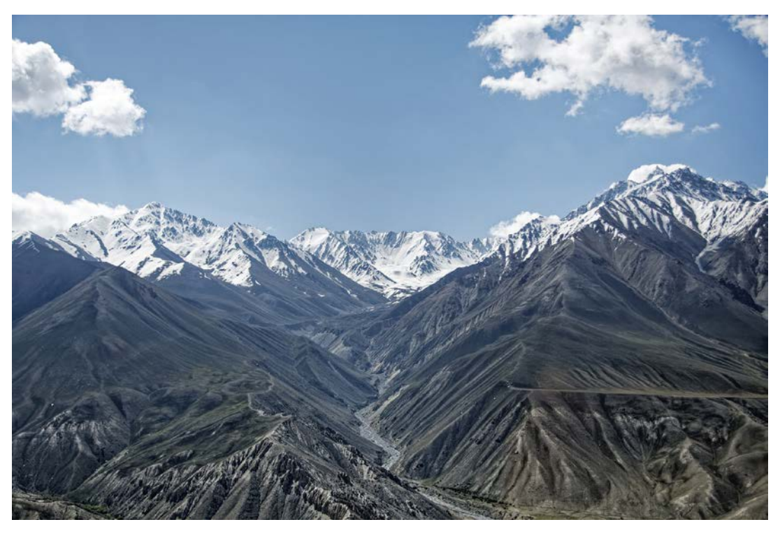
Wakhan River.