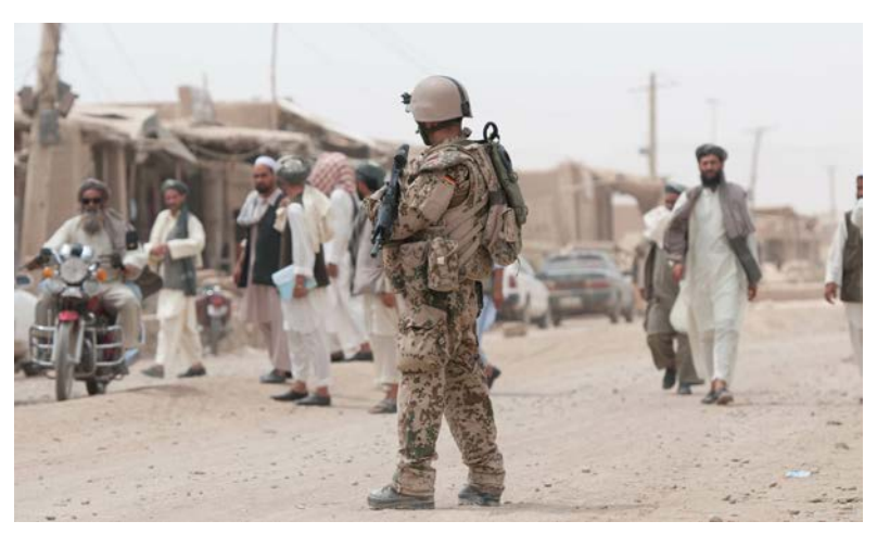
German soldier

This focus on peace talks reflects the degree to which uncertainty is dominating many states' Afghanistan policy. With so little known or even possible to predict about the composition and orientation of a future Afghan state, external powers have leaned into short-term engagement. Almost as if in response to the region's dependency on U.S. actions over the next year, diplomatic efforts presently emphasize influence on near-term events.