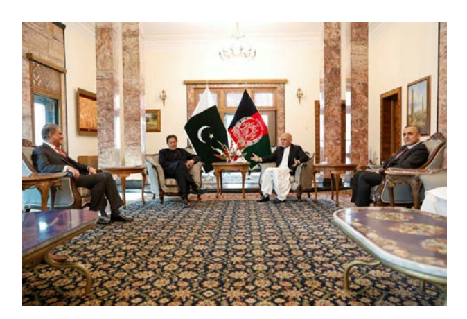
Afghan President Ashraf Ghani (R) meets with Pakistan's Prime Minister Imran Khan at the presidential palace in Kabul.

Islamabad continues to tout its instrumental role in bringing the Taliban to the table with the U.S. in early 2019. However, it has done little since to visibly pressure or persuade the insurgents to reduce violence in Afghanistan, or to offer compromises on governance and power-sharing. Considering how great an impact