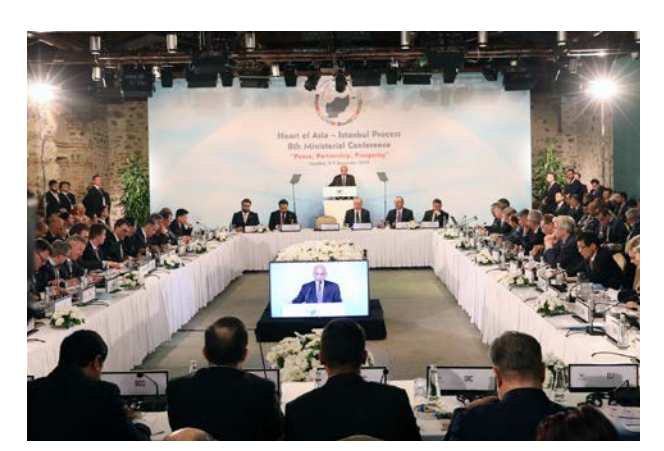
Regional stakeholders convene at the 8th Ministerial Conference of the Heart of Asia-Istanbul Process, December 2019.

EU engagement with China on Afghanistan, considering the gap between their general approach to foreign policy and, in particular, given European concerns about the future of Afghan human rights, might be even more far-fetched than productive exchange with Russia. Nevertheless, the EU has proven willing and able to shape its relations with China in bold new ways, even over the past several months.