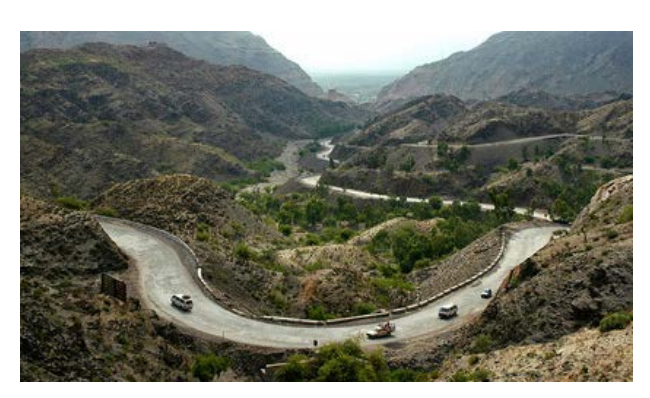
The Khyber Pass in northern Pakistan.

states might begin to fill the vacuum of an American departure, to what degree, and what new regional dynamics might emerge as a result. The European Union finds itself in a dilemma, with several member states genuinely concerned about regional stabilization (and the impact of any lack thereof). However, these concerns are complicated by divergence from the United States' interests and the unequal weight Washington has in the framework of the NATO-led mission in Afghanistan. But the uncertainty inherent in this transitional period need not deter European and regional powers from preparing for a range of potential challenges, recognizing the possible convergence of regional interests in Afghanistan, and committing to meet them together.