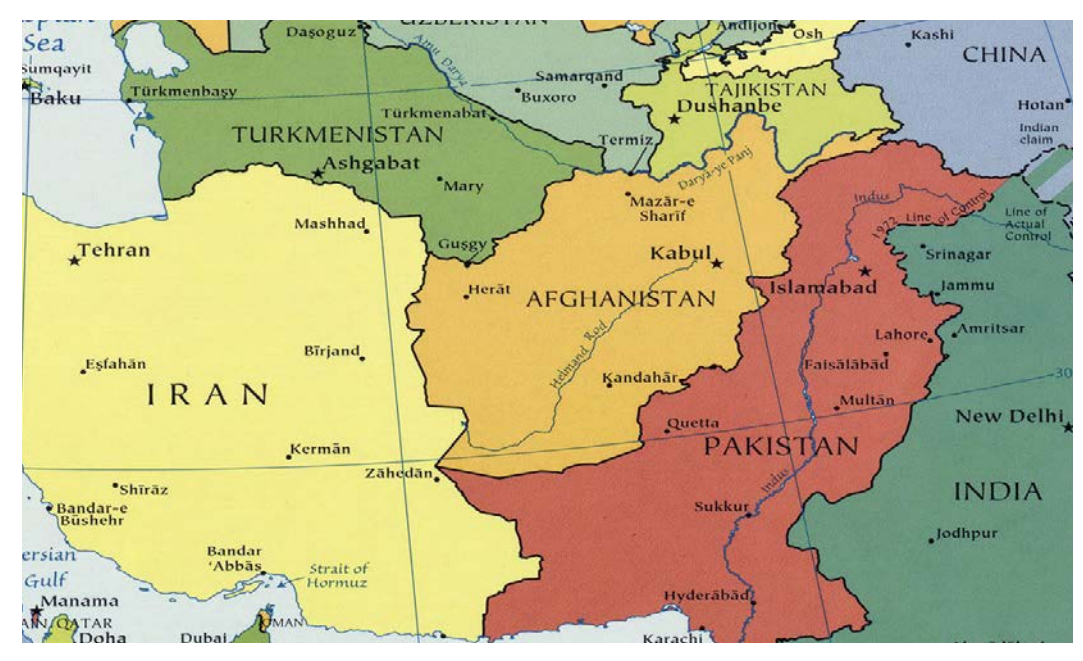
Political map of Southwest Asia.

thematic report synthesizes the findings of a project exploring the scenario-building and policy planning on Afghanistan of several regional states, as well as the European Union and the Transatlantic (or NATO) engagement, in anticipation of the U.S. military exit and reduced U.S. assistance in the future. This project facilitated discussions among a diverse set of active and former officials, policy opinion leaders, scholars, and subject-matter specialists of nine different powers that neighbor or are engaged in Afghanistan's regional security complex. These discussions, additional expert consultations, and a thorough literature review laid the groundwork for a series of nine policy briefs that outline neighboring states' approaches to the political, economic, and security challenges likely to grip Afghanistan and the region in the coming years.1