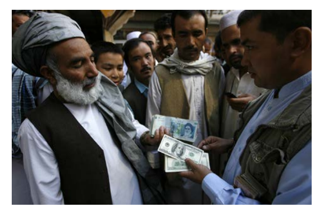
Afghan money changers gather to deal with foreign currency at a money change market.

country troop presence. Instead, New Delhi has amplified narratives meant to convince Western powers currently reinforcing the Afghan government to remain for the sake of stability and security, especially when it comes to the continued need for a robust regimen of regional counterterrorism.