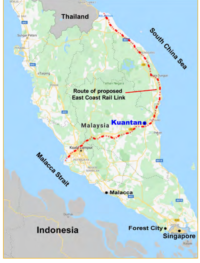
Figure 5 Kuantan Port