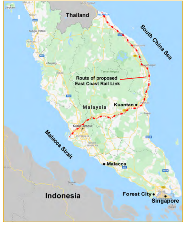
Figure 2 Proposed route of the East Coast Rail Link (ECRL)