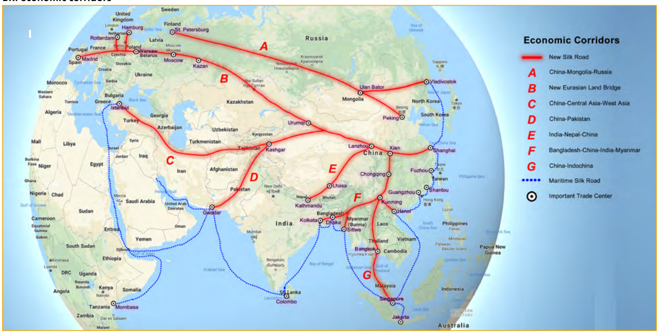
Figure 1 BRI economic corridors