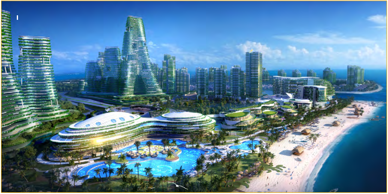
Figure 4 The Futuristic New Town of Forest City