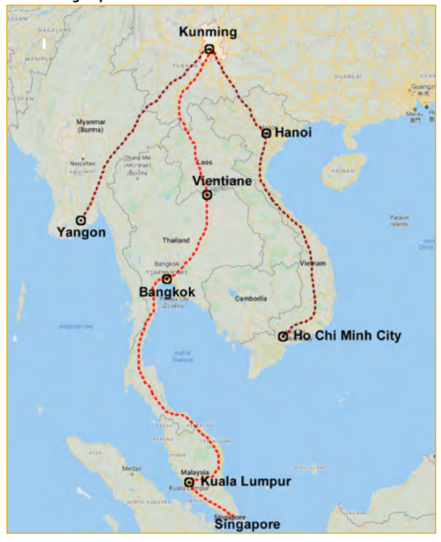
Figure 3 Planned high-speed rail tracks from Southern China to Southeast Asia