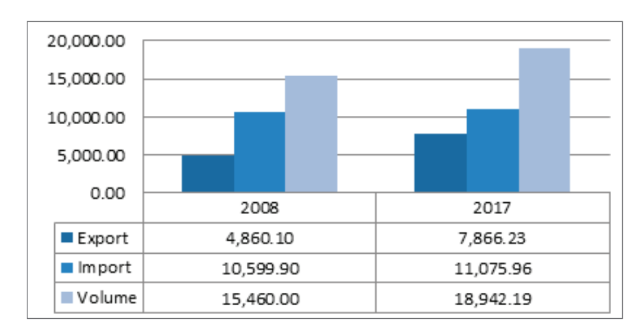
Graph 1: Review of trade balance between BiH and the EU (in million BAM)8

In the time period since CEFTA entered into force, up until today, BiH's exports towards the EU market expanded. Furthermore, from the total value of goods exported in 2017 (11,05 billion BAM) 71,16% was towards the EU market, while 16,20% of the exports were towards the CEFTA market. Imports from EU contribute to 61,08%, while imports from CEFTA are around 12,79% of the total value of imported goods in 2017.